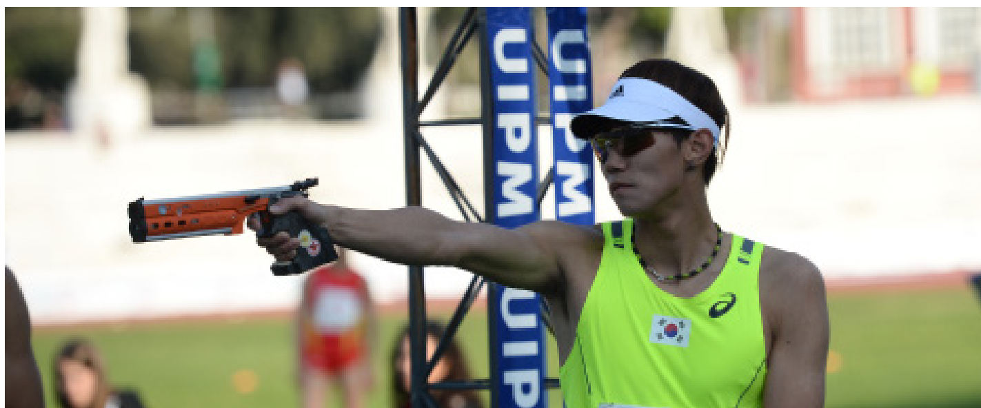
KOREA CLAIMED VICTORY IN THE TEAM MIX RELAY EVENT IN ROME TO END FIVE DAYS OF EXCITING COMPETITION FEATURING MANY OF THE TOP PENTATHLETES IN THE WORLD

"Relay is a team event that brings both genders together and that is something we want to highlight as it is a sport for both men and women to compete alongside each other. Again today in this marvellous stadium we witnessed another great spectacle of that in the final."