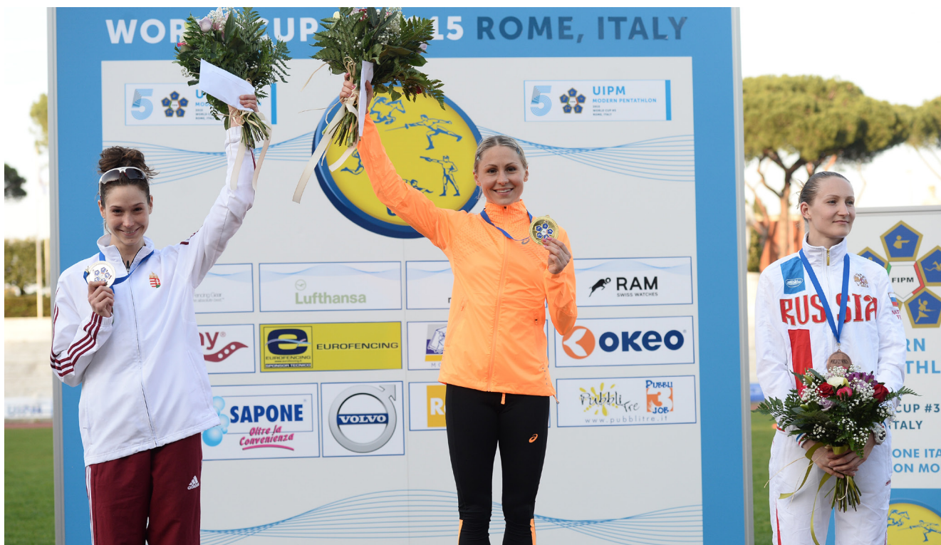
LAURA ASADAUSKAITE WON HER SECOND 2015 UIPM WORLD CUP SERIES EVENT IN ROME

Historical city of Rome hosts top-quality Modern Pentathlon Event