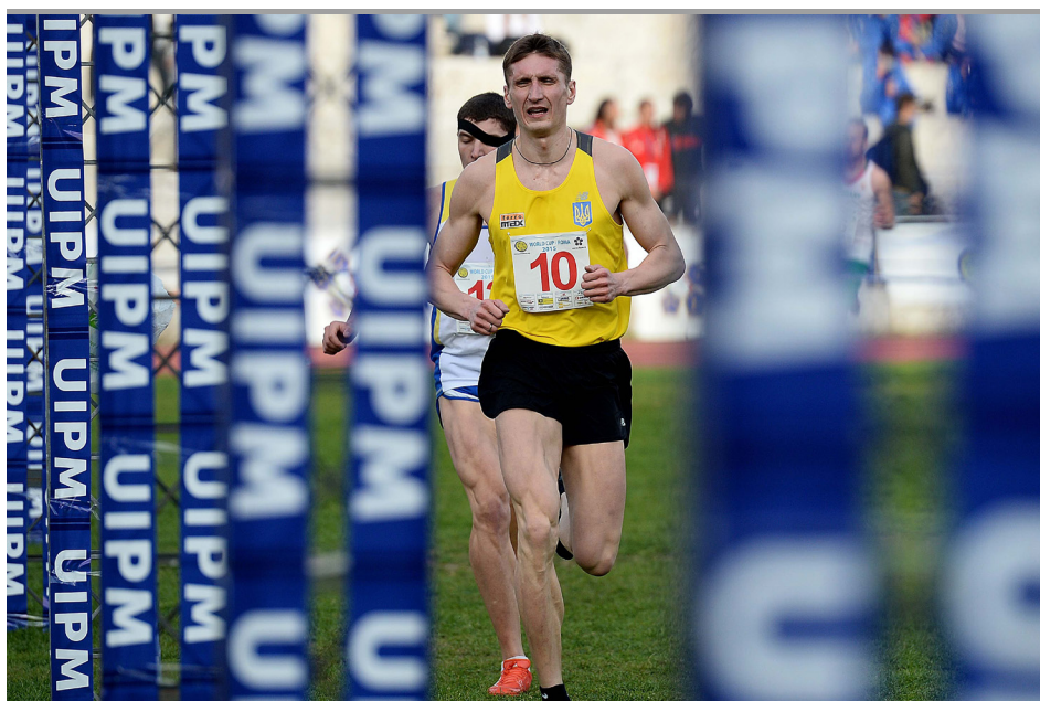
PAVLO TYMOSHCHENKO, THE WINNER OF THE MEN'S INDIVIDUAL COMPETITION, DURING THE FINAL COMBINED EVENT

"You cannot calculate who will be the winner, but there is a group at the top and they have shown today that in high-performance terms our sport is very strong, and the