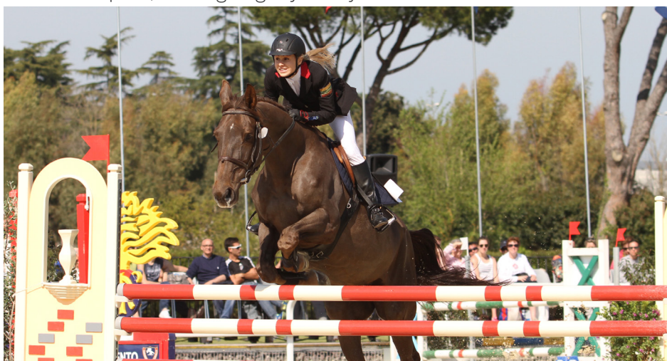
LAURA ASADAUSKAITE (LIT) DURING THE RIDING EVENT OF THE WOMEN'S INDIVIDUAL FINAL

In the pool, Sarolta Kovacs (HUN) was fastest in 2:10.42 and moved up to 2nd in the overall classification.