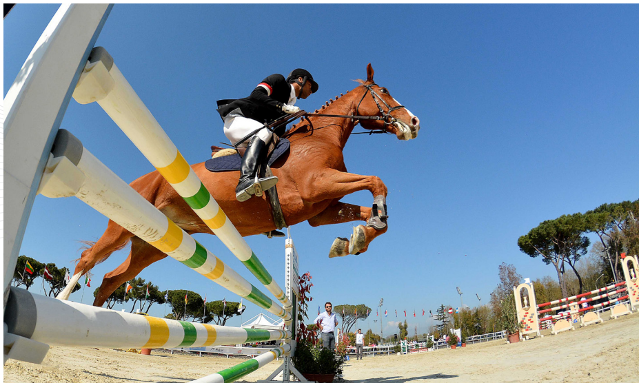
THE PONY CLUB IN ROME PLAYED HOST TO THE RIDING EVENT AT UIPM 2015 WORLD CUP #3