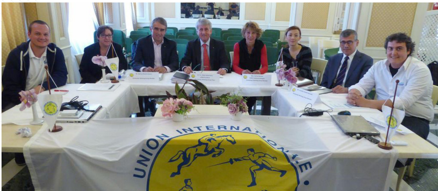
PARA-PENTATHLON WORKING GROUP MEETING IN ROME

movement. A demonstration event is to be organised very soon during one of UIPM's international youth events.