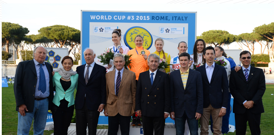
PODIUM OF THE UIPM 2015 WORLD CUP #3 WOMEN'S INDIVIDUAL COMPETITION

Having topped the podium in Cairo at World Cup #2, the reigning Olym-