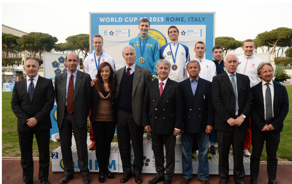
UIPM 2015 WORLD CUP #3 MEN'S INDIVIDUAL COMPETITION PODIUM

He said: "Back in 2000 if someone is winning from 20th place that was quite normal as good runners were