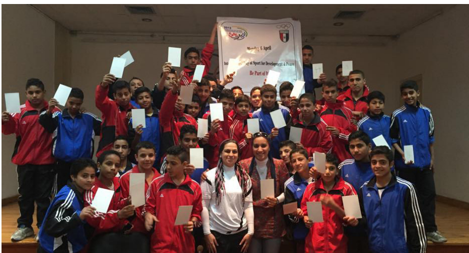
IOC WOMEN & SPORTS AWARD WINNER 2014 AYA MEDANY JOINS YOUNG EGYPTIAN ATHLETES