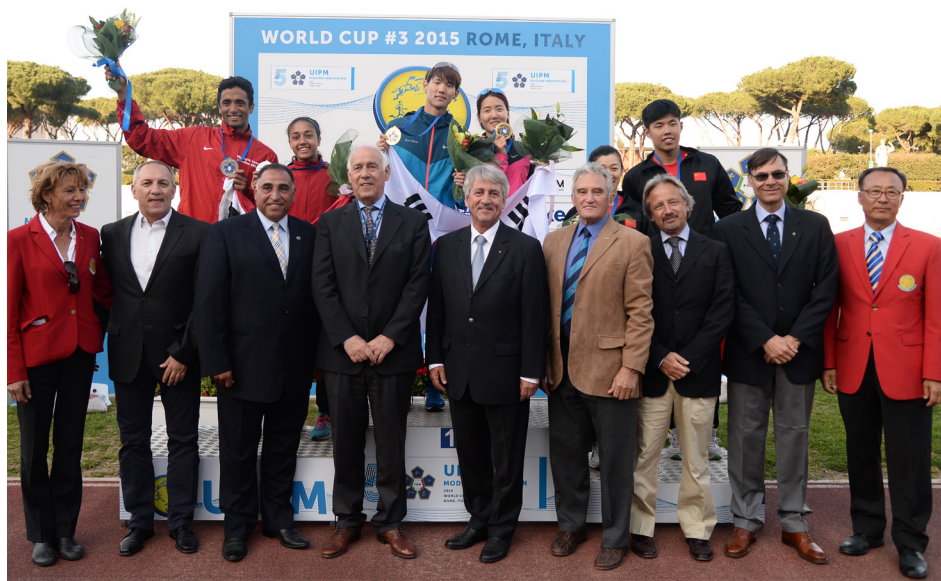
THE UIPM 2015 WORLD CUP #3 TEAM MIXED-RELAY COMPETITION PODIUM

Morsy & El Geziry (EGY) dropped to second with the Koreans now on their own in third.